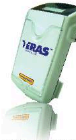
Traffic Revenue & Control Systems An application for automated payment processes at the point-of- collection and supports real-time data reporting