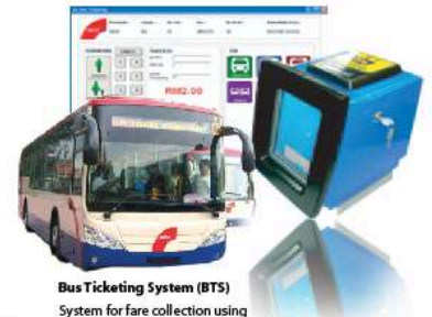
Bus Ticketing System (BTS) System for fare collection using Touch 'n GO card, Cash and Season Pass