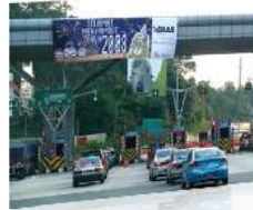
TRACS Traffic Revenue & Control Systems An application for automated payment processes at the point-of- collection and supports real-time data reporting

Tel: 03-7680 7671 HP: 019-357 2457 eMail : zikri@terasworld.com